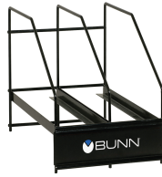
HOPPER RACK, MHG 2 POSITION