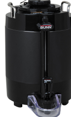
TF SERVER, 1.5G/5.7L MECH BLK NOBASE