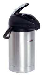
AIRPOT, 3.0L SST LA SINGLE PK