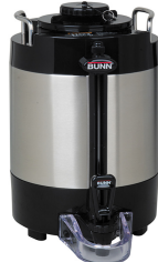
TF SERVER, 1.5G/5.7L MECH NOBASE