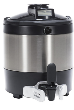
TF SERVER, 1G DSG GEN3 NOBASE