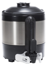
TF SERVER, 1G MECH GEN3 NOBASE