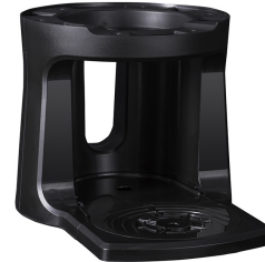
STAND ASSY KIT, TF SERVER