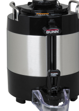
TF SERVER, 1G/3.8L MECH NOBASE