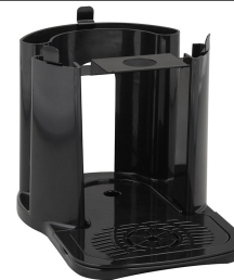
STAND ASSY, TF SERVER